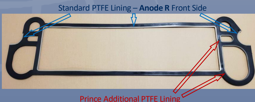
Standard Anode Gasket